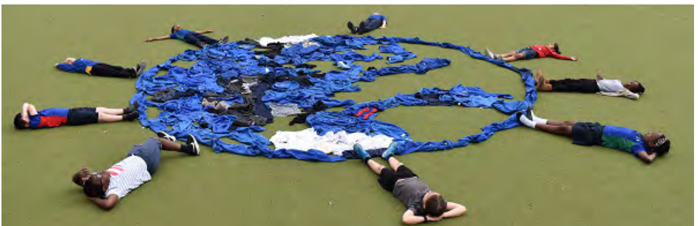
WELLBEING WEDNESDAY ACTIVITY