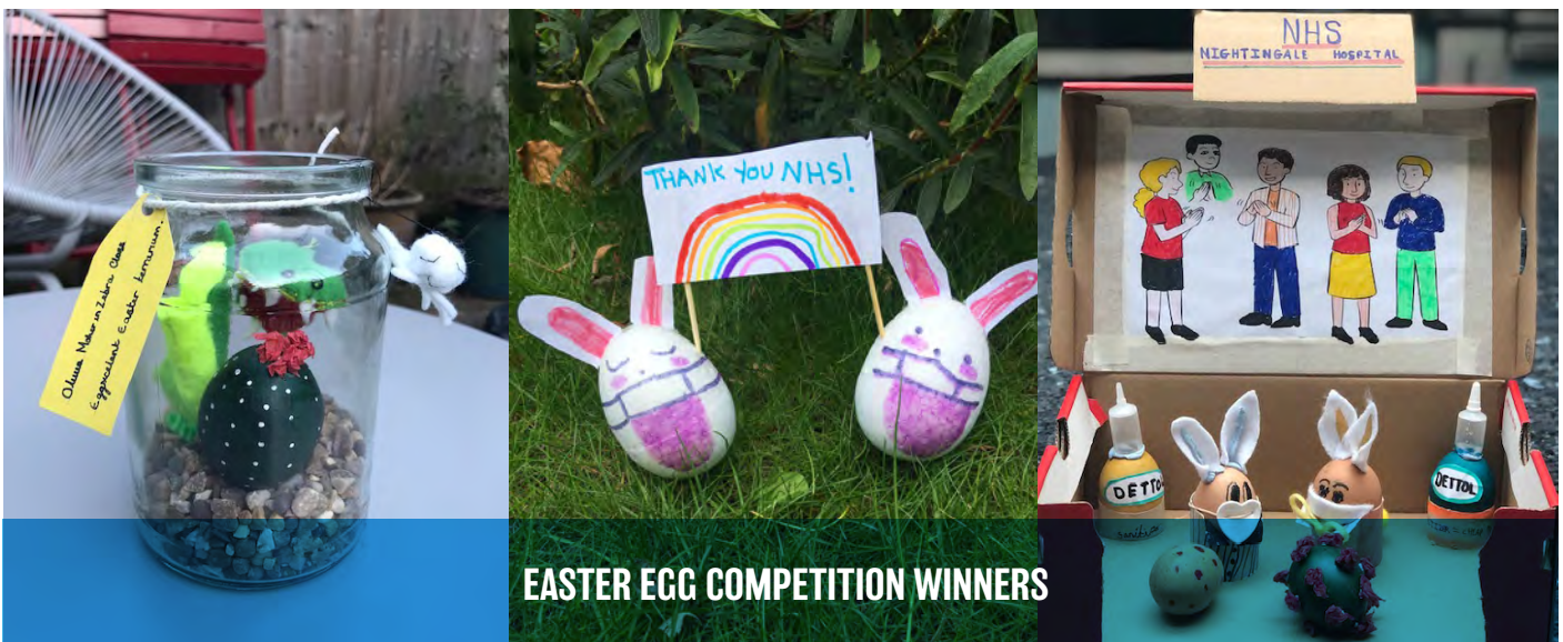
EASTER EGG COMPETITION WINNERS

A copy of the complete Five-Year Strategy document that expands how these aims will be achieved is on the school website.